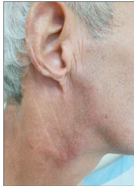
FIGURE 2: An erythematous plaque with an infiltrative border and a central depressed area, sclerosis of the right earlobe.