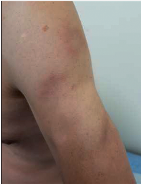
FIGURE 4: Erythematous plaques and partial loss of adipose tissue on the left proximal part of upper extremity.

possible metabolic abnormalities. We informed the patient about the condition and referred to plastic surgery department for improvement of cosmetic appearance.