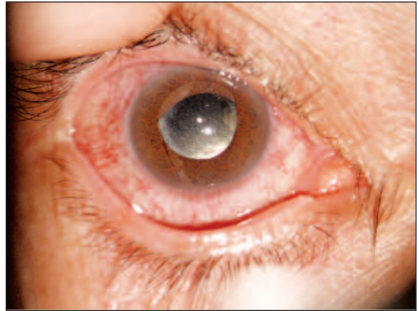
FIGURE 1: Conjunctival and ciliary injection. Pupillary capture between the 9 and 2 o'clock in the right eye.

On the following day, the pupil was round, the IOL was well centered in the posterior chamber, and there was no anterior chamber reaction (Figure