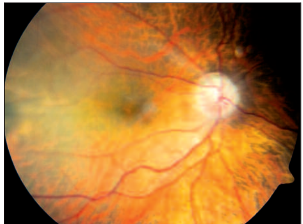
FIGURE 2: Fundus photography within the normal limits.

(See color figure at http://tipbilimleri.turkiyeklinikleri.com/ )