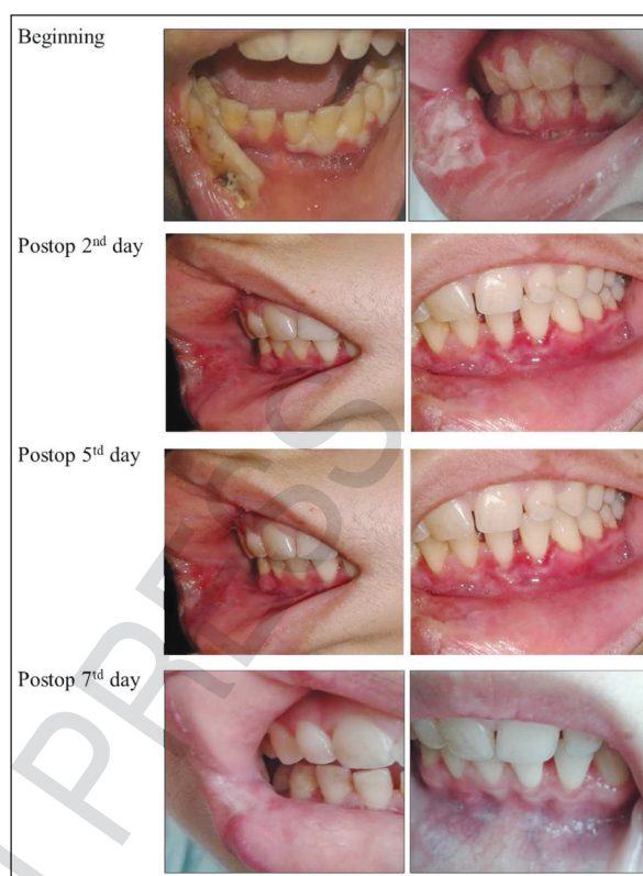
FIGURE 1: Intraoral view of lesions over time.

The histopathological examination of the biopsy sample obtained from the relevant region diagnosed