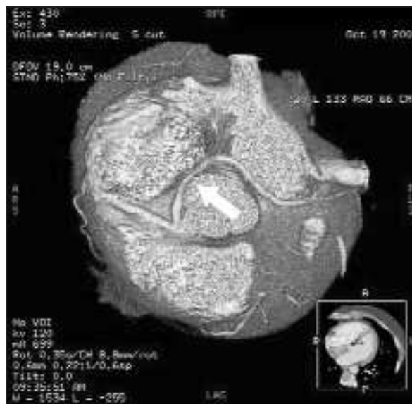
FIGURE 4: Volume rendering.