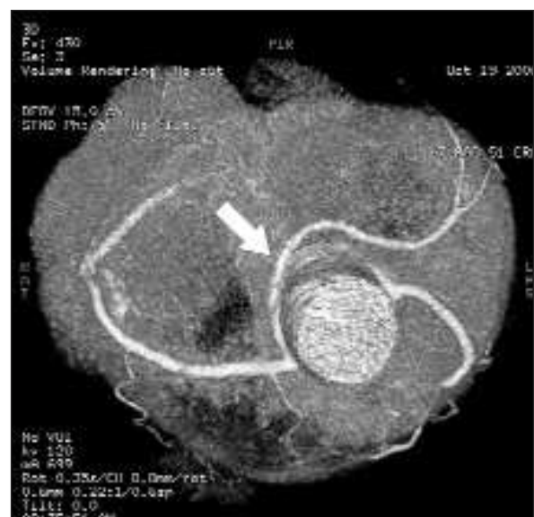
FIGURE 2: Volume Rendering (VR).