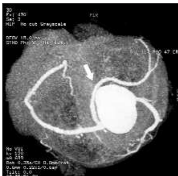
FIGURE 1: HD MIP.

The VR images of the patient revealed that the LMCA, the left anterior descending artery (LAD), RCA and the posterior descending artery (PDA) had normal locations and calibrations. They also revealed that the left circumflex (LCX) artery originated variationally from the proximal portion of the RCA and reached the normal anatomic supplementation area after crossing between the aortic root and left atrium. The lumen of the LCX artery was examined by using the curved image technique and no plaques or intimal deformities were detected (Figure 1-4).