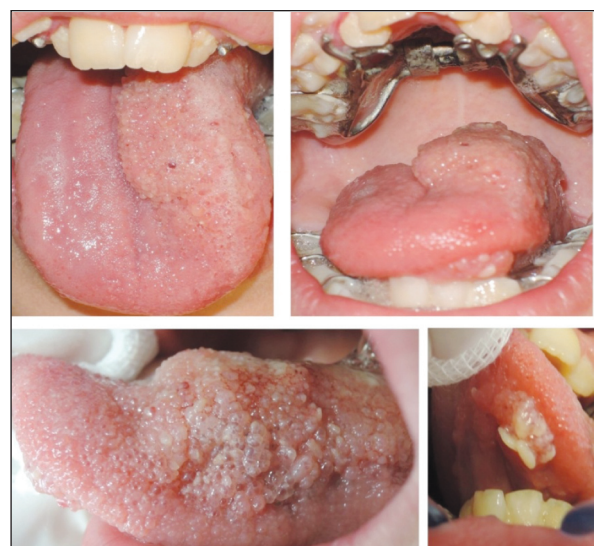
FIGURE 1: Clinical images of the lesion on the dorsal and ventral surface of the tongue.

The swelling was non-painful, with no history of pus discharge or bleeding. Intraoral examination revealed multiple papular lesions on the left side of the tongue, including a few blood-filled papules and some lesions displaying coloration similar to the normal mucosa. Palpation indicated that the lesions were soft, non-tender, and exhibited a rough texture with bumps (Figure 1). The large lesion on the dorsum appeared as a nodular 30x20x10 mm structure with a multiple and transparent blister surface, typical of superficial lymphangiomas. The small lesion located at the tip of the tongue is approximately 10x5x5 mm in size. Based on these clinical features, a preliminary diagnosis of lymphangioma was considered.