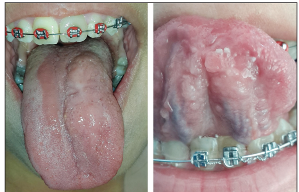
FIGURE 4: The situation of the lesion one month after three sessions of cryotherapy. At this stage, diode laser excision was performed.