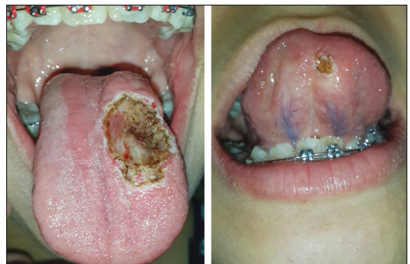
FIGURE 5: Clinical images taken during the excision of the lesion with the help of diode laser.

Following a one-month interval, the remaining lesion was excised in a single session using a diode laser (LAMBDA Medical laser technologies/Vicenza-Italy, doctorSmile erbium&diode laser, wavelength 808 nm, 300 second duration, pulsed mode and 2 watts) under local anesthesia, with no requirement for sutures (Figure 4, Figure 5).