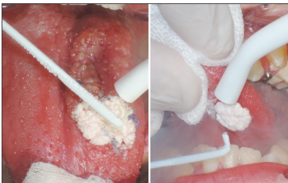
FIGURE 2: Images taken during cryotherapy applications to the lesion following incisional biopsy.

During the first session, cryotherapy was applied to lesions on both the dorsal and ventral surfaces. Subsequent cryotherapy sessions were conducted at two-week intervals. The large lesion on the dorsum was treated by dividing it into four imaginary equal sections, and each imaginary part received one-minute cryotherapy sessions. The small lesion on the ventral surface was also treated in one-minute sessions (Figure 2). An incisional biopsy was taken during this stage for pathological examination, with the tissue subsequently processed and stained with hematoxylin and eosin. The histopathological analysis uncovered multiple expanded lymphatic passages, encompassed by a solitary layer of endothelial cells featuring flattened to oval nuclei, brimming with lymph and sporadic inflammatory cells. These enlarged vessels resided immediately below the epithelial layer, with scarce connective tissue stroma dividing them from the epithelial surface above. The connective tissue stroma displayed regions of lymph accumulation, while the overlying epithelium appeared as parakeratinized stratified squamous epithelium, confirming the lymphangioma diagnosis (Figure 3).