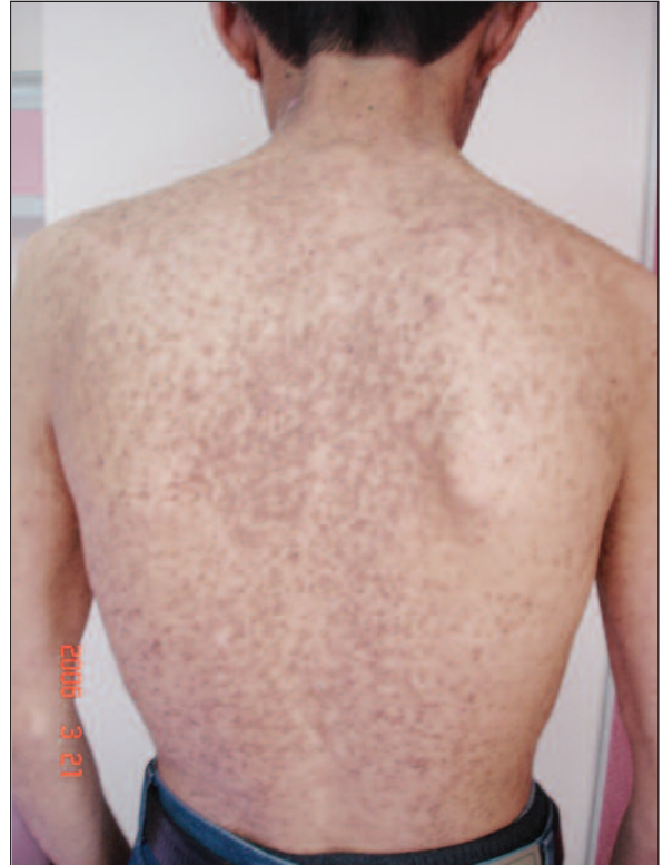
FIGURE 2: After six months of the cyclosporine therapy, the appearance of the skin lesions.

skin lesions were observed and photographed, and routine laboratory tests were done. No pathology was detected in laboratory findings during the subsequent control visits. During the treatment, the patient's complaint about pruritus decreased; however, there was no change in the severity of the