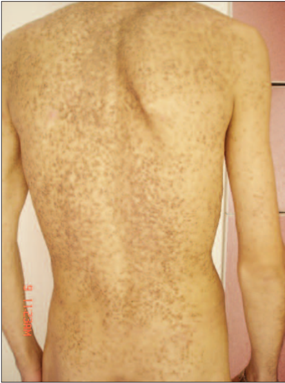
FIGURE 1: The appearance of the skin lesions before cyclosporine therapy.

her, both of his sons and daughter also had the same disease with variable clinical involvements. Before he had admitted to our clinic, he had been treated several times with topical retinoids and systemic retinoids with partial benefit.