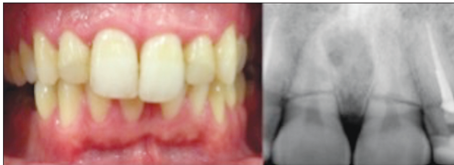
FIGURE 3: 1-year follow-up clinical and radiological views.