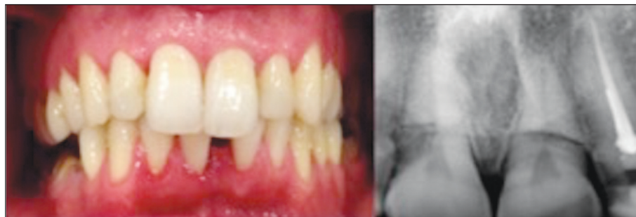
FIGURE 4: Clinical and radiological aspect showing the normal function of maxillary right and left first incisors after 2 years.

riodontal ligament healing. These radiological findings suggest that root fracture healed with interposition of hard and soft tissue between the fragments which is known as one of the root fracture healing patterns.