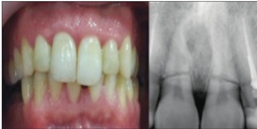
FIGURE 2: 6-month follow-up clinical and radiological views. Periapical radiograph revealed the normal periodontal ligament spaces and there was no radiolucent lesion in apical area of the injured maxillary right and left first incisors without any canal treatment.