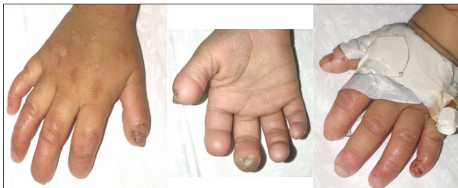
FIGURE 2: Absence of a distal phalanx in the patient's right-hand 2 nd and 3 rd fingers and left-hand 2 nd finger