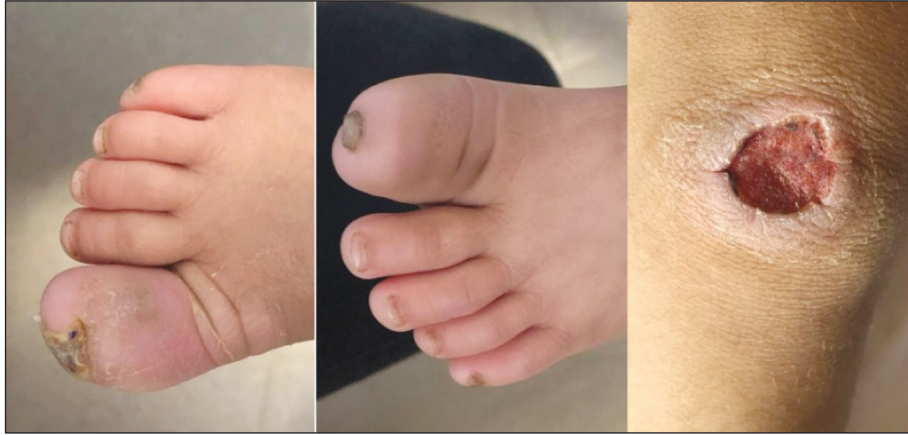
FIGURE 3: Deformity due to self-mutilation in the big toes and a 3x3 cm lesion with an ulcer in the middle and hyperemic surroundings on the knee