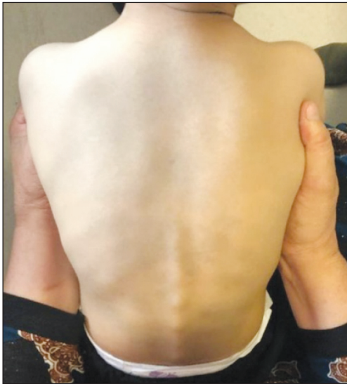
FIGURE 4: Mongolian spot on the back