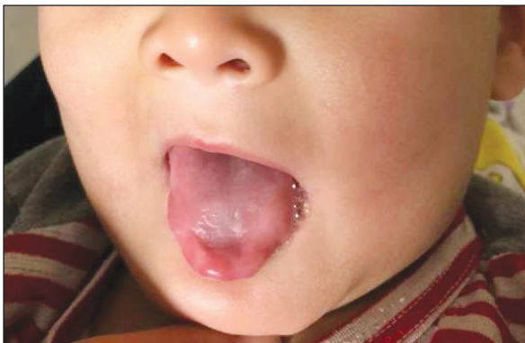
FIGURE 1: Loss of lingual papillae on the tongue