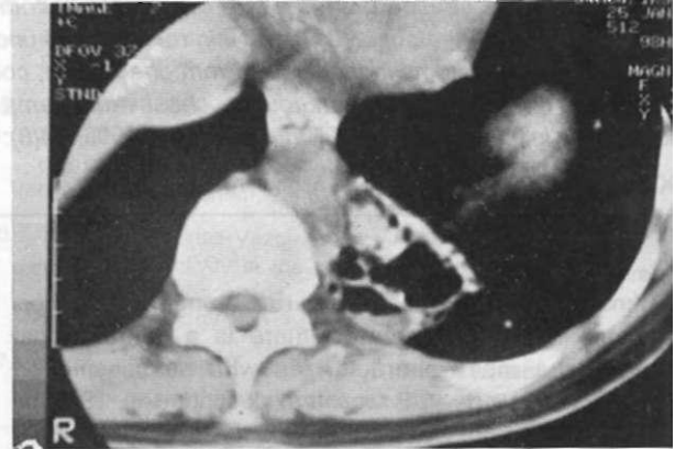
Figure 2. The computerized tomographic appearance of ILS in the left lower lobe.