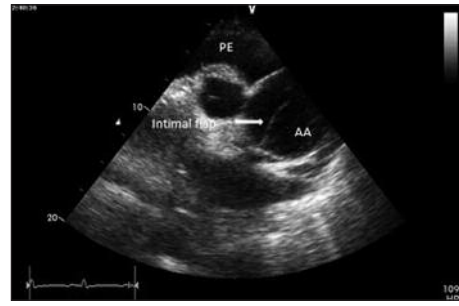
FIGURE 1: Modified parasternal long axis view of two dimensional transthoracic echocardiography demonstrating intimal dissection flap.

Once the diagnosis of acute proximal type aortic dissection is suspected, it is essential to confirm the diagnosis promptly and accurately as mortality increases in progressing hours. Mortality is very high being 1-2% per hour during the first two days, if not managed. 1 Diagnostic modalities currently available for this purpose include aortography, CECT, MRI, and TTE or TEE. Which modality to be chosen depends on clinical status of the patient and technical availability of the hospital. 2 Non-invasive diagnostic modalities like CECT, MRI may be preferred over invasive aortography. 3 However, in a case with impending cardiac tamponade, transferring the patient for CECT or MRI may be time consuming. TEE, as it's a semi-invasive diagnostic tool may be preferred especially in the operating room. In recent years, 3DTEE started to be used more often as it maintains more accurate diagnosis compared with 2DTEE. Sasaki et al. emphasized in their study that coronary involvement is better evaluated by 3DTEE, rather than by computed tomography and 2DTEE in the operating room. 4 Similarly, Joshi et al displayed that