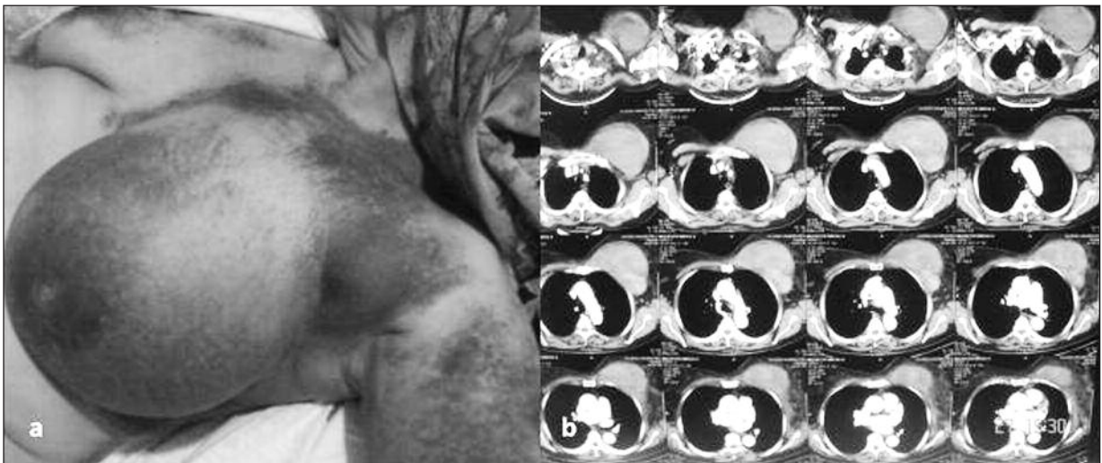
FIGURE 1: a. Swelling and a purple-red discoloration of the left breast, sternum, part of the right breast, left axilla, b. The large hematoma under the left breast on CT.

Warfarin therapy can be given temporarily or for life long. Patients on warfarin must have regular laboratory monitoring for prothrombin time (PT) and INR. PT is a test to determine the time needed for blood to clot by measuring the activity of clotting factors I, II, V, VII, and X.