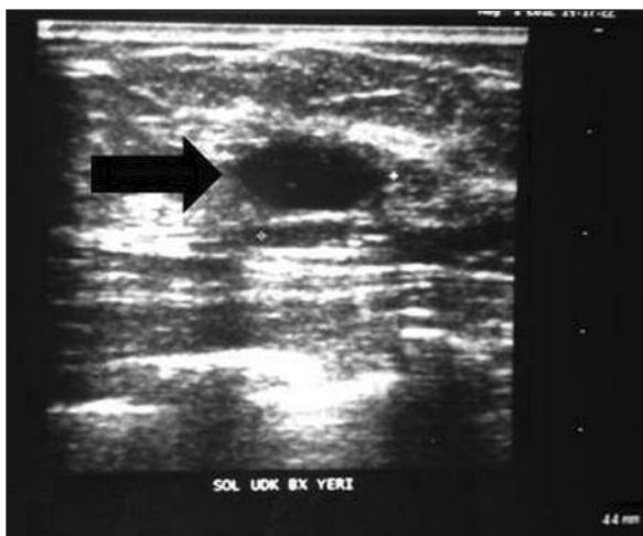
FIGURE 1: Ultrasonography of breast shows a heterogeneous hypoechoic mass measuring 10x14 mm with irregular contours which had fibrotic shrinkage around.

A thirty-five year old woman was applied with well defined palpable mass in the upper outer quadrant of the left breast, that was presented one and a half month. She was pre-menopausal and there was no family history of cancer, no history of trauma or previous surgery. A mobile palpable mass with an oval shape (fibroadenoma?), no palpable axillary lymph node was revealed at physical examination. A 10x14 mm irregular countoured, heterogeneous hypoechoic mass with fibrotic shrinkage around was reported at ultrasonography (USG) (Figure 1). Invasive ductal carcinoma reported at incisional biopsy. There was no distant metastasis in thoraco-abdominal computerized tomography and whole body bone sintigraphy. A left breast-conserving mastectomy and axillar dissection was performed. A mixed invasive carcinoma (ductal component 90%, lobular component 10%) within fibroadenoma was reported at microscopic