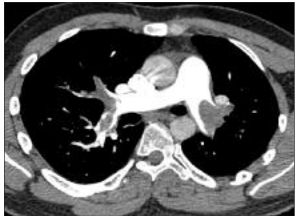
FIGURE 1: Axial multidetector computed tomographic pulmonary angiography image shows major pulmonary thromboembolism involving the left main artery and the right lobar and segmental arteries.

A 25-year-old man was admitted to the emergency department with shortness of breath and retrosternal chest pain. About six months ago, he had deep vein thrombosis and pulmonary thromboemboli treated with antithrombotic and followed by oral anticoagulant therapy (Figure 1). Physical examination was unremarkable. Blood pressure was 110/80 mmHg, pulse rate was 82 beats/min and respiration rate was 24 breaths/min. An electrocardiogram showed normal sinus rhythm and was otherwise normal. On ECO, systolic, diastolic and mean pressures in the pulmonary artery were normal. Arterial blood gas analysis, at room air, showed a pH of 7.39, pO 2 of 73.5 mmHg, pCO 2 of 33.1 mmHg, cHCO 3 19.8 mmol/L and O 2 saturation of 95%. A chest roentgenogram showed no abnormality. MDCT angiography was performed with a