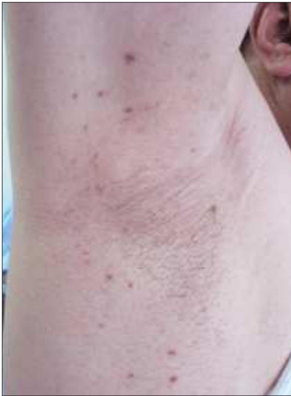
FIGURE 3: Appearance of red-brown colored macular lesions in his right axillary region.