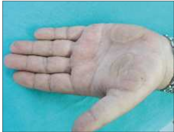
FIGURE 1: Appearance of well-demarcated, minimally scaling, yellowish plaques on his left palm.

Lichen planus is a unique, common inflammatory disorder that affects the skin, mucous membranes, nails, and hair. 1 Lichen planus appears in various clinical variants which are categorized according to the site of involvement, morphology and confi-