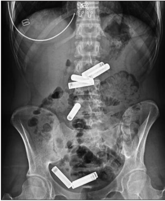
FIGURE 2: Passage of 3 batteries to colon.