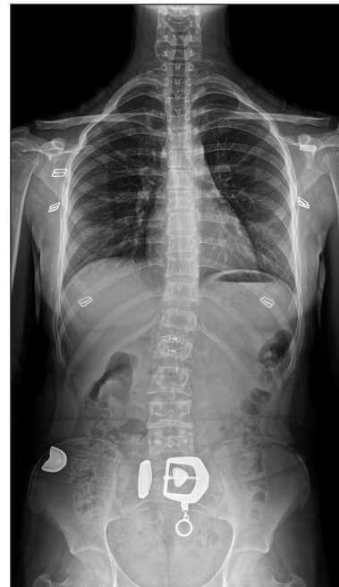
FIGURE 3: Scoliosis in the left thoracolumbar region and sacralization (Vertebral X-ray).

A diagnosis of BN can be made based on clinical findings and, ideally, a skin biopsy of the lesion. 6 Histologically it is characterized by moderate acanthosis with elongation of the rete ridges and a variable degree of hyperkeratosis. The basal layer of the epidermis is hyperpigmented, although there is no increase in the number of melanocytes. Melanophages are present in the dermis and there is an increase in the number of arrector pili muscles. 6 We reached the