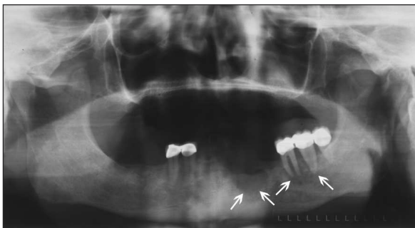
FIGURE 3. Panoramic radiograph of the patient.

Microscopically for both lesions, a diffuse tumoral infiltration which was composed of atypical lymphoid cells was observed from the ulcerated surface epithelium of mucosa through the bone. The malign cells were centroblast like cells with medium sized cytoplasm and they had large vesicular nuclei. Mitotic figures were frequently available. Apoptotic cells were seen within the tingible body macrophages (Figure 4). In immunohistochemical studies, neoplastic cells showed diffuse, strong and membranous staining with CD45 (LCA) and CD 20 (Figure 5) whereas rare mature T-cell lymphocytes were positively stained with CD3 and