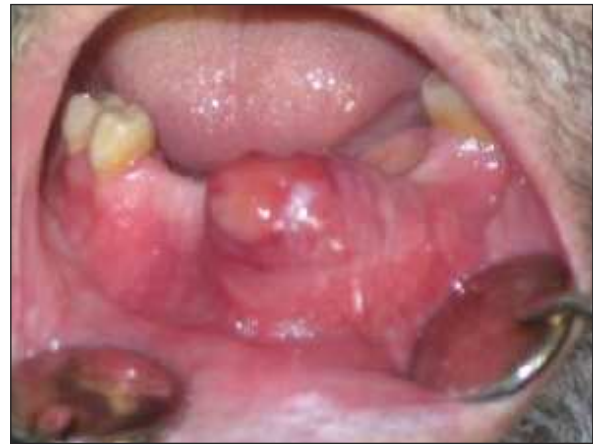
FIGURE 1. Intraoral appearance of the mass localized at the anterior region of the mandible.

At the extraoral examination neither asymmetry, nor swelling was present. There was no lymphadenopathy at the submental, submandibular and cervical lymph nodes also.