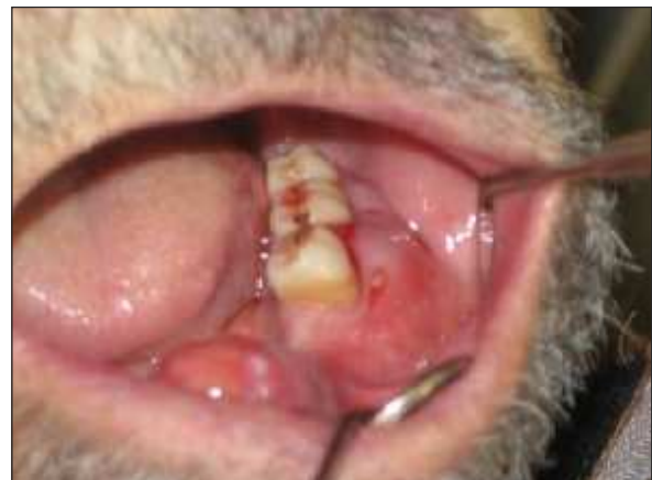
FIGURE 2. Intraoral appearance of the swelling localized at the posterior region of the mandible.

phadenopathy at the submental, submandibular and cervical lymph nodes also.