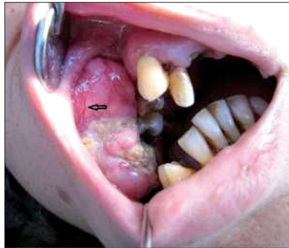
FIGURE 1: Clinical appearance of soft tissue mass on the right the alveolar process and vestibular sulcus.

A 41-year-old woman presented with severe pain, progressively enlarging mass on the right maxilla, and swelling in the right zygomatic facial region that had continued for 2 months. On intraoral examination, a tender, fixed, lobular, relatively well-defined mass that was soft in consistency was found on the right alveolar process extending to the vestibular sulcus and gingiva. There were whitish plaques with debris, calculus, and telangiectasia on the overlying mucosa (Figure 1). Extraoral exami-