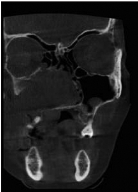
FIGURE 3: Coronal section on cone beam computed tomography revealed cortical destruction of the walls of the right maxillary sinus and medially invaded into the right nasal cavity, orbit and pterygopalatine fossa, ethmoid sinuses.

Clinically, PNET is seen in a wide age range, from newborn to 74 years, with a mean age of 21 years; it mainly affects children and adolescents. The sex distribution of patients has varied among different cases. 1 PNET accounts for 1-4% of all soft tissue