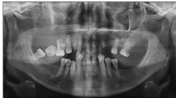
FIGURE 2: The panoramic projection showing erosion of medial, inferior and posterolateral walls of the right maxillary sinus and destruction on right maxilla with an appearance of teeth floating air.

nation revealed tender and soft diffuse swelling on the right side of the face with obliteration of the nasolabial fold resulting in facial asymmetry (Figure 2). A single enlarged submandibular lymph node was palpable on the right side. This was non-tender, firm in consistency, and immobile.