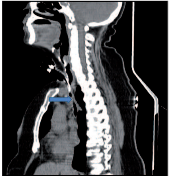
FIGURE 2: Computed tomography image of stenosis located at the front wall of the trachea below the tracheotomy line (blue line).

terior laminae. Tracheal lumen was totally obstructed by the destroyed cricoid laminae (Myer-Cotton grade 4). In addition, there was a 2-cm-long stenotic segment below the tracheotomy line at the anterior wall of the trachea, most probably caused by tracheotomy tube irritation; in this plane, the anteroposterior diameter of the trachea was 5 mm (Myer-Cotton grade 2) (Figure 2).