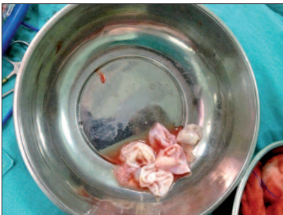
FIGURE 3: The photograph shows multiple hydatid cysts removed in the operation.

cyst series it has been reported between 5 to 6.2%. Intrathoracic extrapulmonary hydatid cyst may be found in chest wall, mediastinum, lobar fissure, diaphragm, and pleura. 9,10