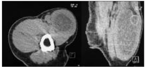
FIGURE 2: Axial (left) and sagittal (right) computerized tomography demonstrates that hypodense mass confined within the biceps brachii.

of the lesion; immunoelectrophoresis is the most specific method. 5 US is useful in diagnosis, showing the size, localization and type of the cyst. The sen-