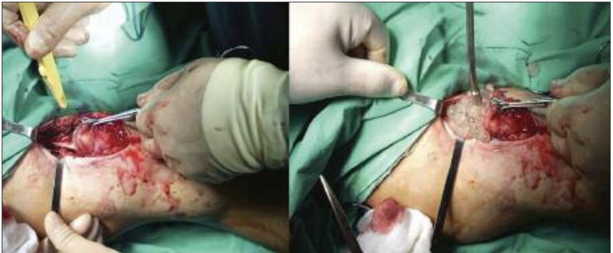
FIGURE 3: Intraoperative appearance of a hydatid cyst within the right biceps brachii.

of the lesion; immunoelectrophoresis is the most specific method. 5 US is useful in diagnosis, showing the size, localization and type of the cyst. The sen-