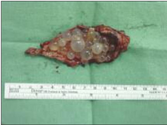
FIGURE 4: Macroscopic appearance of a hydatid cyst after it was cut open.