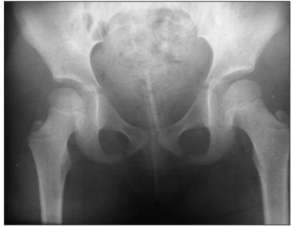
FIGURE 1: X-ray of pelvis showing a thin and long dense image in pelvic region.

Without the examination by vaginoscopy, vagina was irritated with Bethadine solution, and