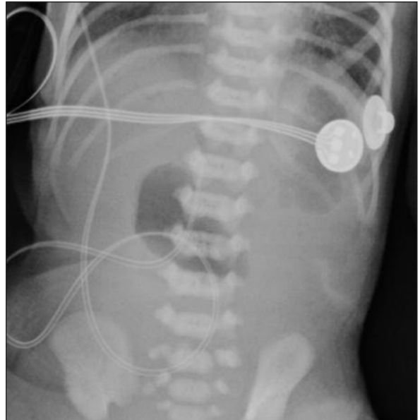
FIGURE 2: Double bubble at plain abdominal graphy

(See color figure at http://www.turkiyeklinikleri.com/journal/turkiye-klinikleri-journal-of-case-reports/1300-0284/tr-index.html )