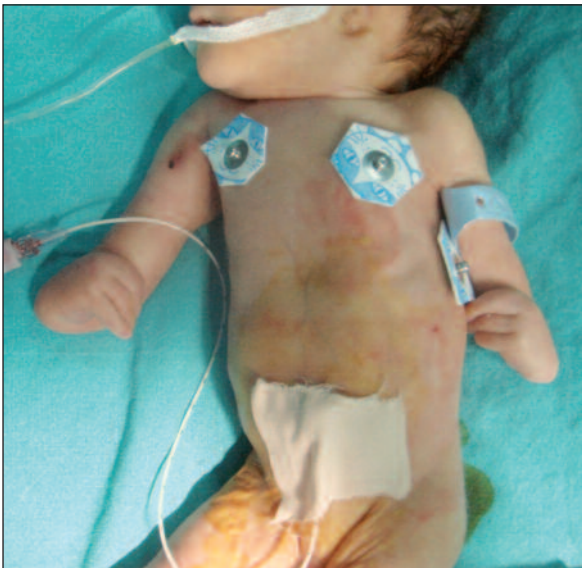
FIGURE 1: Patient's general outlook.

A 29 week gestation, 1230 g baby was born from 25 years old mother because of premature rupture of membrane. This was the third pregnancy of the mother and the other children were healthy. There was no teratogenic contact and infection during pregnancy. Antenatal ultrasound scan of the baby showed a distended stomach and duodenum with a “double bubble” sign. The baby had also agenetic ears, agenetic forearms and penoscrotal hypospadias (Figure 1). Plain radiograph of the abdomen showed the classic “double bubble” sign (Figure 2). Renal fusion anomaly was determined at ultrasonography. Laparotomy showed a dilated first and second parts of duodenum. The distal third and fourth parts of the duodenum as well as the proximal jejunum were absent. The remaining small bowel assumed a helical configuration around a single marginal artery, with a typical “apple peel” configuration. The mesenteric artery was absent. There was a wide mesenteric gap between duodenum and jejunal remnant (Figure 3). The duodenum was anastomosed to the hypoplastic jejunum. A revision was performed for anastomosis leak, but baby succumbed also with potency of very low birth weight and prematurity.