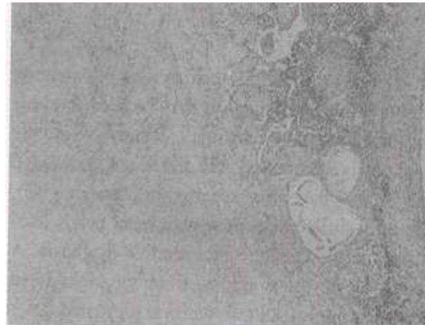
Figure 2. Renal pelvic tumor, lying beneath the desquamated mucosa. Few dilated collecting ducts, surrounded by an infiltration of lymphocytes (HEX25).

Leiomyoma should be differentiated histologically from other rare spindle cell tumors