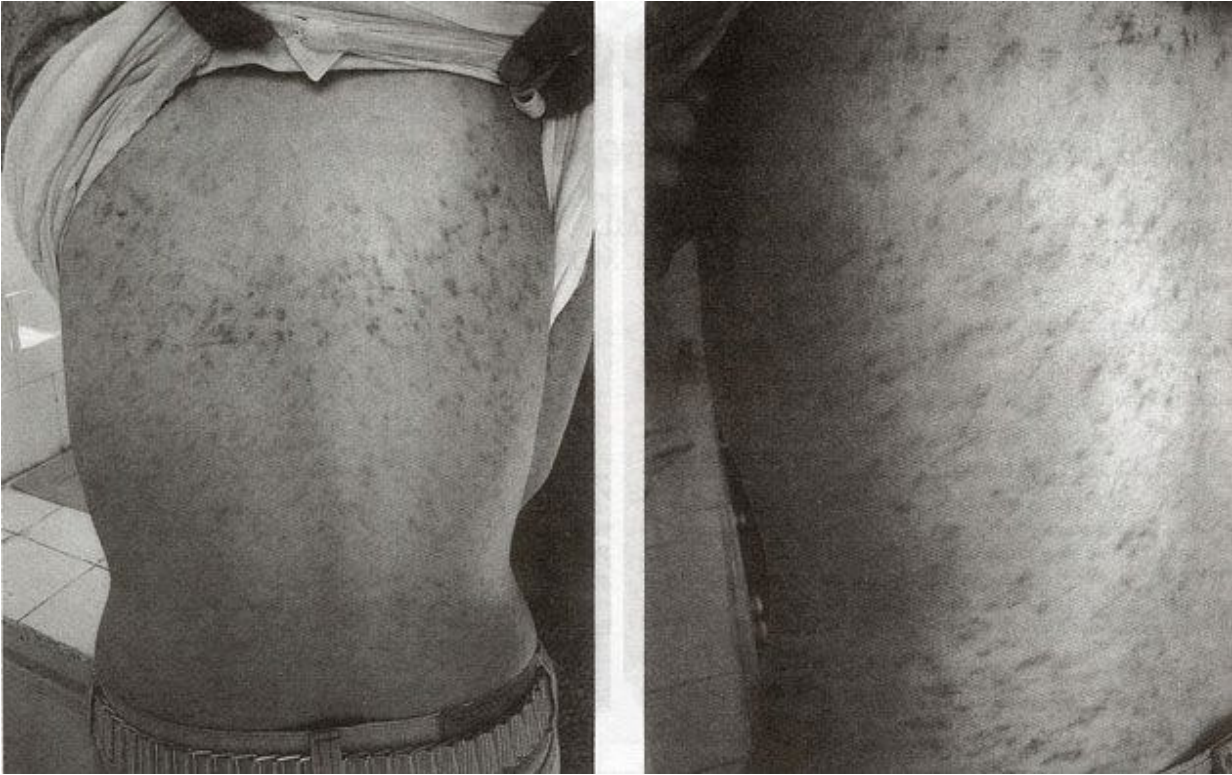
Figure 1. The appearance of “christmas tree” and maculopapular eruptions on the trunk.

boplastin time, biochemical and urinary analyses were all within normal limits. Antinuclear antibody, rapid plasma reagin, rickettsial profile, and streptococcal antibody titers were unremarkable.