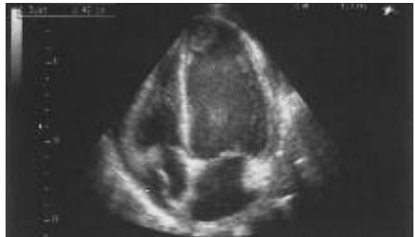
FIGURE 2: The echocardiogram showing the apical thrombus, spontan echo-contrast and right atrial compression.