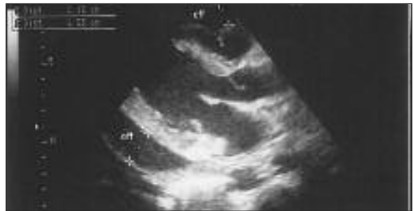
FIGURE 3: The echocardiogram showing the right ventricular compression.