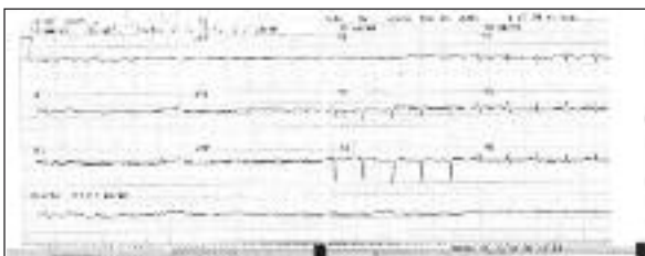
FIGURE 1: The admission 12-leads electrocardiogram reveals sinus rhythm, low voltage and poor r wave progression.

The patient was hospitalized for investigation and treatment. She underwent pericardiocentesis due to tamponade findings and 300 cc of bloody fluid was removed. The fluid was exudative and analysis showed 600 WBC/mm 3 and density-