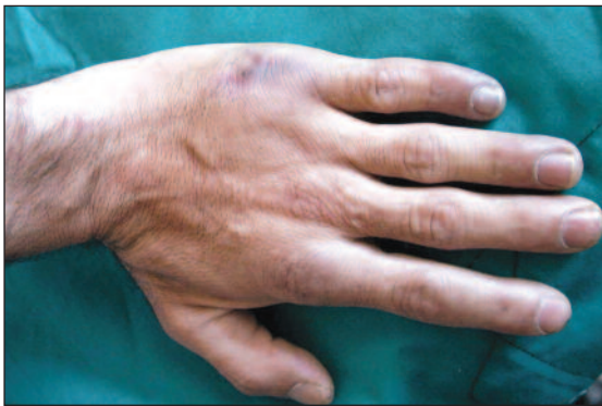
FIGURE 2: Appearance of fifth finger of the left hand.