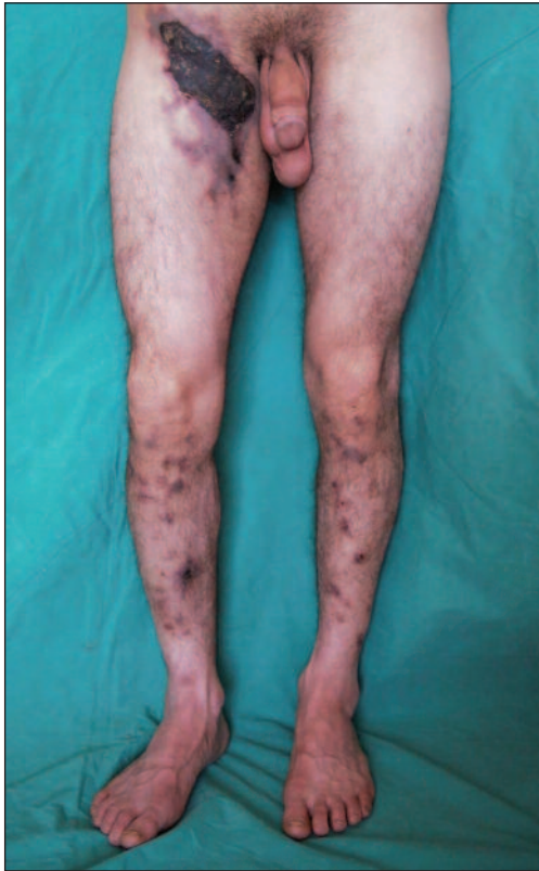
FIGURE 1: Appearance of skin necrosis in the right groin.