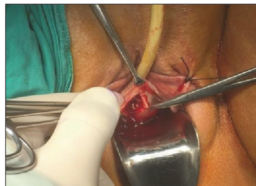
FIGURE 2: Single incision for mini-sling.