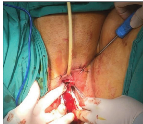
FIGURE 1: Out-to-in transobturator tape technique.

Patients in both groups were discharged on the first postoperative day and were called for a control in the postoperative 1 st week in terms of possible wound infection or the presence of hematoma. Patients were advised to prohibit sexual intercourse for a minimum of 6-8 weeks postoperatively. Long-term results of the patients were evaluated and recorded at the 12 th month postoperatively. Preoperative demographic data, peroperative and postoperative results of TOT and SIMS groups were compared.