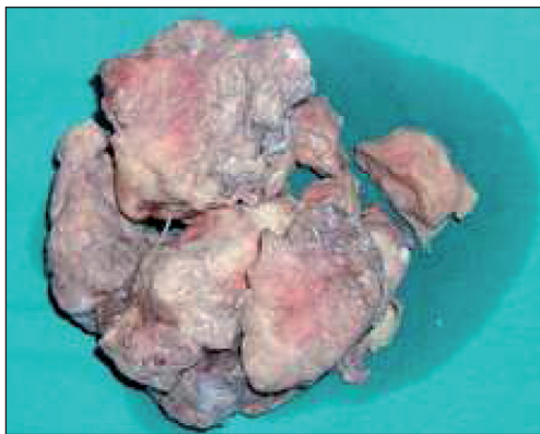
FIGURE 3: Almost 90% of the mass was resected.

diet orally. He gained weight and his BMI was 22, he was happy with his respiration and voice. He had no significant neck mass. However, some mass was still persisting at the thoracic inlet, which was asymptomatic at all.