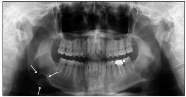
FIGURE 1: Panoramic radiography reveals a large radiolucent lesion on the right side of the mandible.

The lesion was asymptomatic, and no history of expansion was recorded. The patient's medical history was unremarkable. The patient was informed about possible odontogenic pathologies and surgical interventions. The patient was also informed about the advanced imaging techniques and their advantages and disadvantages. An informed consent was taken from the patient. Be-