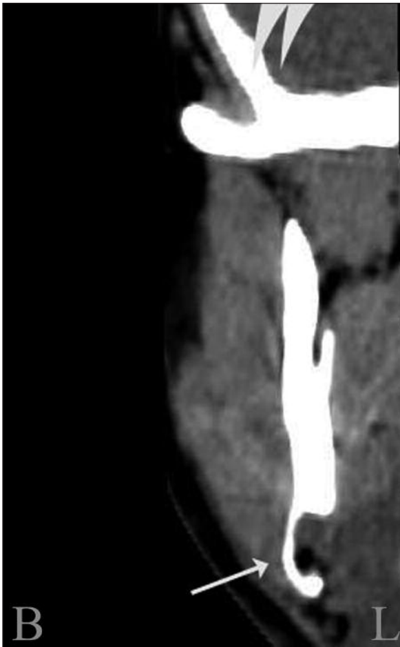
FIGURE 3: Axial CT scan of the mandible with bucco-lingual reconstruction program showing the sharply demarcated lesion, affecting the lingual surface of the mandible.