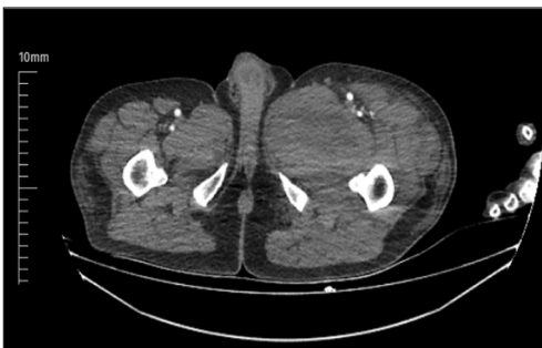
FIGURE 3: Intramuscular hematoma of 90×78 mm between the anterior muscle planes of the left femur.

Doppler ultrasound examination performed for lower extremity artery showed an appearance compatible with a hematoma of approximately 80×75×125 mm in size. Fluid-debris leveling was detected between deep muscle planes near the left femur. Additionally, CT showed a slight heterogeneous intramuscular hematoma of 90×78mm in the widest part between the muscle planes adjacent to the left femur anterior and supported the doppler ultrasound findings (Figure 3). Before the diagnosis of hematoma, the coagulation status was normal (INR=1.0; aPTT=23.2 sec; fibrinogen= 465 mg/L; D-dimer=0.9 mg/L, platelet count 319,000/ \mu L). The patient was consult and evaluated for the drainage of the hematoma with the interventional radiology clinic. It was decided that drainage was not required in the patient who did not show extravasation and increase in hematoma size in control imaging. The patient, without a decrease in Hgb due to transfusion during the follow-ups, and with regressed complaints of swelling and bruising was called to the outpatient clinic and discharged. Written informed consent was obtained from all patients. Approval from the Ministry of Health was obtained for this study.