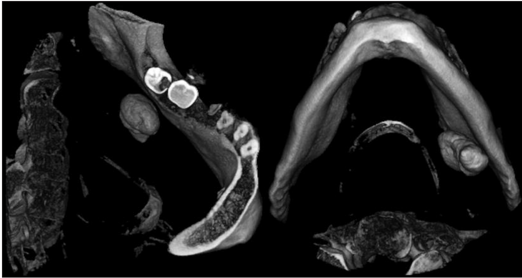
FIGURE 2: Three-dimensional reconstructed cone beam computed tomographic images from different aspects showing submandibular megalith.