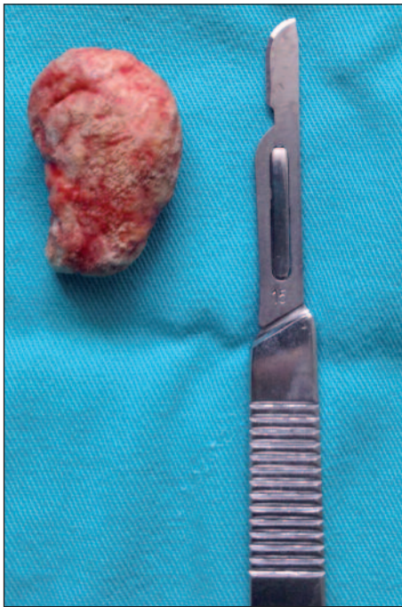
FIGURE 4: Macroscopic view of the 30 mm sized submandibular megalith.

may reveal the calculus. Ultrasonography is widely used the least invasive method and 90% of all stones larger than 2 mm in diameter can be detected as echodense spots on ultrasonography. 4 Sialoendoscopy has been introduced as a minimally invasive surgical procedure for the diagnosis and treatment of salivary ductal diseases. With the advantages of this new technique, clinicians can visualize the duct lumen and the pathologic features, making the diagnosis according to the endoscopic findings. 13 By injecting radiopaque dye into salivary glands, orifice sialography can display radiolucent calculi as filling defects. Application of sialography is restricted and contraindicated in acute infectious manifestations. By applying high-resolution imaging protocols with slice thicknesses of 0.2 to 0.5 mm, 3D medical CT can successfully display even the smallest or semicalcified calculi. MRI is reported to be a valuable additional diagnostic method in difficult cases, or when further soft tissue diagnosis is necessary. 14 Dreiseidler et al. stated that diagnostic sensitivity and specificity levels