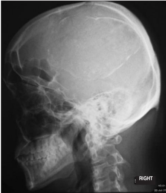
FIGURE 1: Lateral view of skull X-ray film. A large calcified mass is seen over the right fronto-temporo-parietal region.

Neurological examination at our clinic revealed a left sided spastic hemiparesis more pronounced on the distal part of the extremities. He had flexion contracture on his left wrist. His left leg muscles were atrophied and this leg was 3 cm