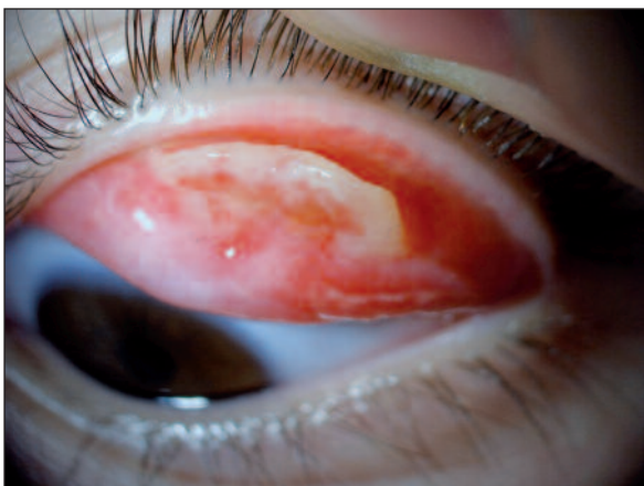
FIGURE 1: Bright-pink colored membranous mass localized in the upper palpebral conjunctiva.

In the external examination of the eyes, a mucopurulent discharge on the left side and a thickening of the upper eyelid were seen in the left eye. Biomicroscopic examination revealed a hypertrophic pseudomembrane in the upper left tarsal conjunctiva. The cornea and the lens were clear and the posterior segment examination was normal. A conjunctival culture was taken. The membrane was removed from tarsal conjunctiva by dissection under general anesthesia. The macroscopic examination of the specimen revealed a 0.6x0.3x0.3 cm bright pink lesion with a firm consistency and a smooth surface. In the histopathologic examination, a considerably thick acellular eosinophilic fibrinoid substance resembling patches of erosion was seen under the surface epithelium (Figure 2). In other areas, active chronic inflammation and focal hyalinization were seen. The histochemical test for amyloid revealed Congo red and Cresyl violet positivity (-). This accumulated material was considered to be fibrin. The free plasminogen level was found to be 16 mg/dL (normal value being 80-120 mg/dL). Based on the clinic, histopathologic and biochemical findings, the diagnosis of ligneous conjunctivitis was made. The plasminogen levels of the mother and father were 74 mg/dL and 76 mg/dL. This lower limit values suggested that mother and father may be carrier. No