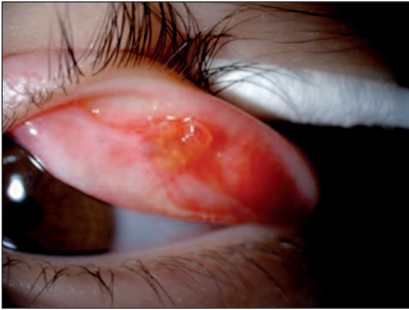
FIGURE 3: The final appearance of the lesion which significant reduction with systemic and topical fresh frozen plasma treatment.

(See for colored form http://oftalmoloji.turkiyeklinikleri.com/ )