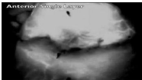
FIGURE 1: The ischemic zone in the single-layer bladder-bowel anastomotic line in open surgery.

Right after the injection of 1 ml Indocyanine Green (Sigma-Aldrich), the perfusion of the bladder-ileum anastomotic line was evaluated using photodynamic eye (Hamamatsu Photo Dynamic Eye-Hamamatsu-Japan). The photodynamic eye was placed 15 cm above the anastomotic line, and images were obtained and recorded. The images were printed and longitudinal lines with 3-mm intervals were drawn on the images. The widths of the ischemic zones corresponding to the lines were measured with a linear scale, and the measured values were expressed as median [minimum-maximum (min-max)].