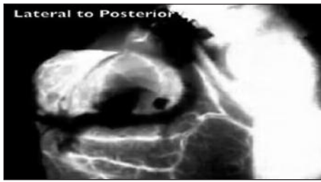
FIGURE 3: The ischemic zone in the two-layer bladder-bowel anastomotic line in open surgery.