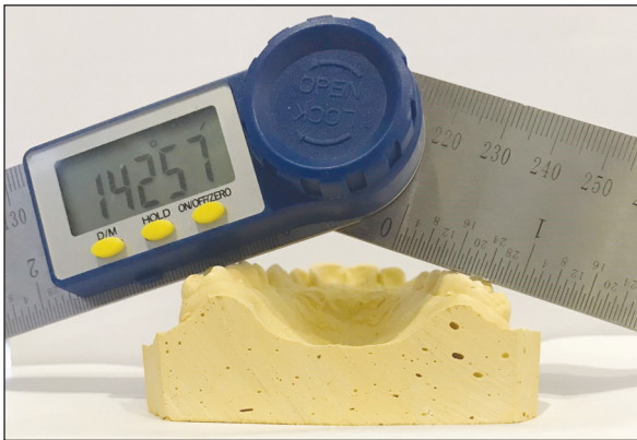
FIGURE 3: The measurement of the angle between the right and left first molar occlusal surfaces.