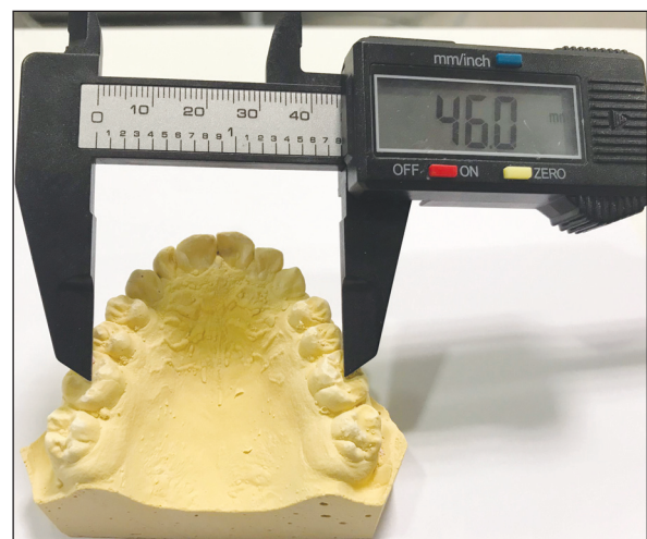
FIGURE 2: The measurement of the occlusal distance between the right and left first molars.

2) Gingival distance between the upper right and left teeth #3, #4, #5, and #6 (The deepest point of the palatal gingival margin was taken as reference.)