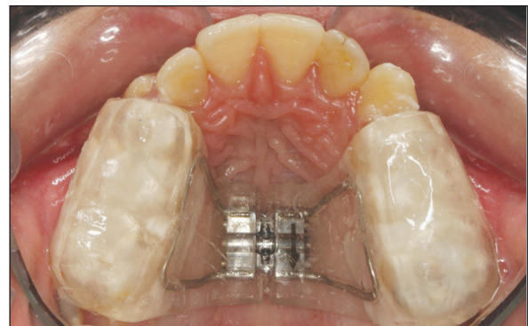
FIGURE 1: Acrylic cap-splint maxillary expansion appliance.

Two different activation protocols were applied to the patients. In the RME group, a constant 2QD activation was applied during the entire expansion period. In the SRME group the semi-rapid activation protocol was applied as 2QD for the first 3 days, 1 quarter turn per day for the next 4 days, and 1 quar-