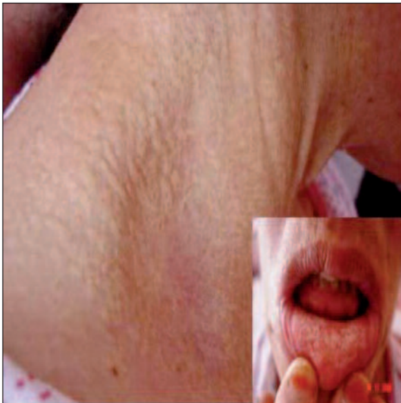
FIGURE 1: Multiple yellowish papules around the neck and on the lower lip. (see for colored form http://dishekimligi.turkiyeklinikleri.com/ )

Laboratory investigations were as follows: haemoglobin 8.5 g/dL and hematocrit 26.5%. Biochemical tests including liver and renal function tests, serum electrolytes and proteins were within