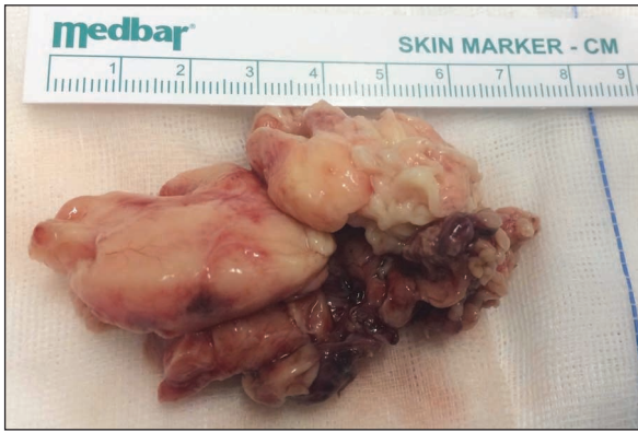
FIGURE 2: The macroscopic view of the lesion postoperatively.

mm in size and a lipoblastoma was suspected (Figure 3). The surgery was performed under general anesthesia. A parallel incision to the skin lines was performed and the lesion was identified just beneath and dissected meticulously. The lesion was very close to axillary vessels and nerve bundles. Macroscopically, the tumor was 6x6 cm. A minivac drain was placed which was removed on the second postoperative day prior to discharge. The histopathologic examination revealed a lesion that had more solid areas compared to lipoma and had lipoblasts showing myxoid degeneration with multi-lobules. No mitosis or necrosis could be shown. He has been free of any symptoms in the last four years.