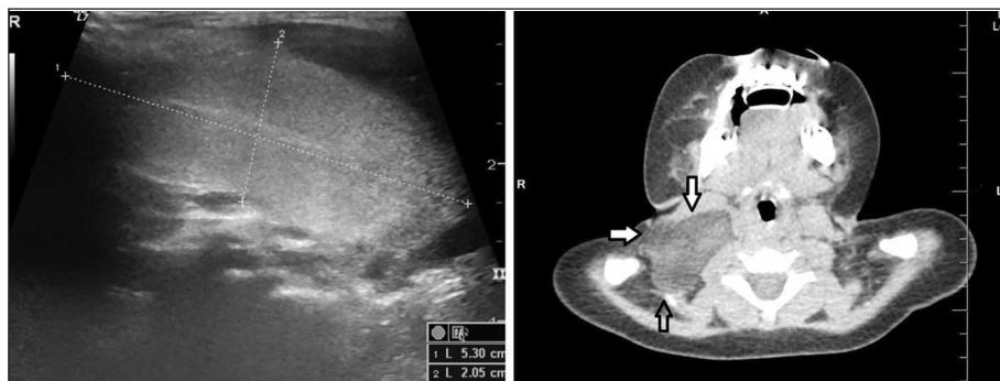
FIGURE 1: The preoperative work-up that demonstrates the lesion on the right side of the neck by ultrasonography on the right and computerized tomography on the left.

The second patient was a 1-year old boy with a painless right anterior axillary swelling. The CT scan demonstrated a fatty intense encapsulated lesion with a partial soft tissue in it. The lesion was 51x30x52