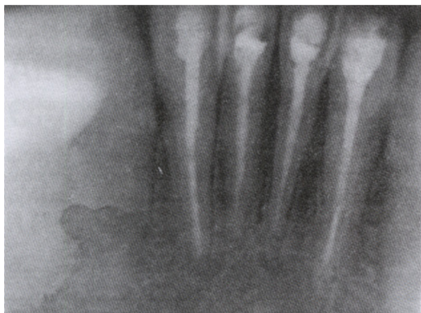
Figure 4. The root canals were filled with gutta percha and diaket sealer at the end of one year.