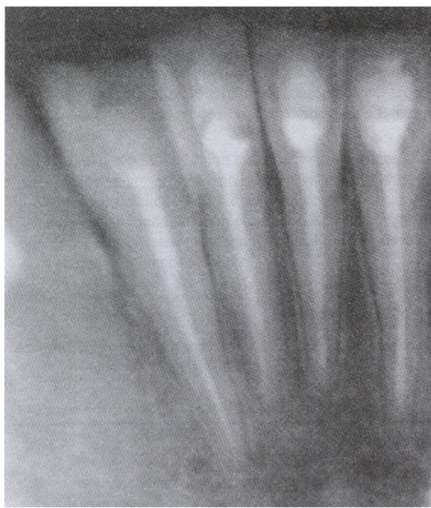
Figure 5. The radiographic evaluation of case at the end of 3 years.

radiography alone is not adequate in diagnosis of large periapical lesions (whether granuloma or cyst). However, distinct diagnosis is not important due to the same treatment of granuloma and cyste as an endodontically.