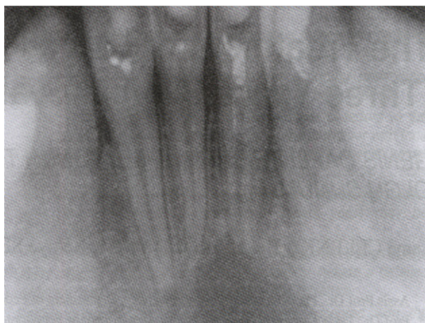
Figure 2. The radiographic evaluation of case (after 3 months).