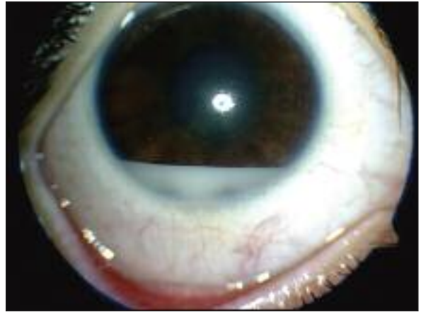
FIGURE 1: Slit-lamp photograph of right eye demonstrating leukemic hypopyon at presentation.

could not be visualized; however, B mode ultrasonographic examination did not reveal any pathologic finding. Dilated fundus examination of the left eye was completely normal. A treatment with a topical steroid drop (1 drop/hour), tropicamide (3 drops/day), and topical combined glaucoma agents; dorzolamid HCL and timolol maleat combination (2 drops/day) and brimonidine tartrate (2 drops/day) was started and the patient was hospitalized in the haematology clinic for the further investigation. On physical examination, no organomegaly or lymphadenopathy was detected. Neurologic examination did not reveal any deficit.