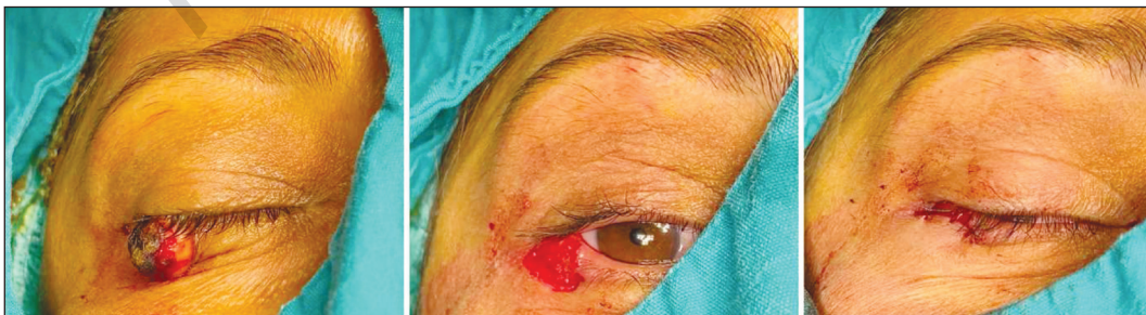
FIGURE 2: Intraoperative images show the excision of the mass and the suturing of the eyelid margin.

Clinically, juvenile and adult xanthogranulomas are most commonly observed on the skin and as a solitary lesion. In a study that analyzed 13 cases of JXGs on the eyelid, the median age at which the disease manifested was 9 years (range: 1.2-47.0). 9 Within the same study, an additional 19 eyelid JXG