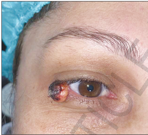
FIGURE 1: A round, elevated yellow-orange mass of approximately 1×1 cm in diameter, with well-defined borders on the lateral region of the right lower eyelid including eyelid margin.

The differential diagnosis included chalazion, sebaceous cyst, actinic keratosis, pyogenic granuloma and all types of eyelid malignancies. The patient underwent an excisional biopsy and the lesion was sent for histopathologic examination (Figure 2). Histopathology results indicated that the cells of the lesion were strongly positive with CD68, while Langerin, CD1A which are Langerhans cell markers, and S100 were negative, consistent with a diagnosis of JXG.