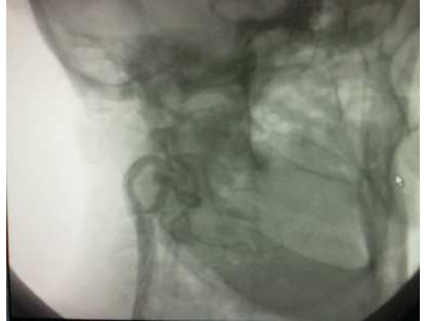
Figure 2. Lateral angiographic view obtained with a selective left carotid artery injection demonstrating normal left carotid angiogram.

In this paper, we present a case with an ectopic salivary tissue within the left carotid bifurcation. Ectopic salivary gland tissue occurs in many sites within the head and neck region and has even been found in other anatomical sites including anal mucosa. Head and neck site involvement includes the lateral and posterior neck, tongue, middle ear, thyroid, pituitary gland and mandible. 3,4 Carotid body tumors are relatively rare tumors that originate from paraganglionic tissue in the neck and are