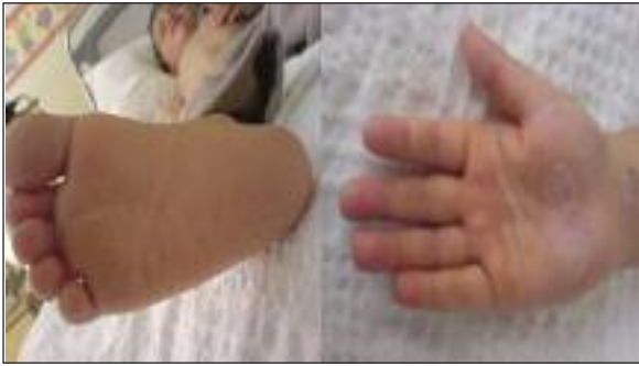
FIGURE 2: Desquamation of palms and soles in the patient with Kawasaki disease.

and ESR were all increased two fold. Pulse methyl prednisolon was started at a dose of 30 mg/kg for 3 days. After 3 days, hydrops was disappeared again. Prednisolon was started at a dose of 0.5 mg/kg/day besides ursodeoxycholic acid and aspirin treatment. Echocardiography was normal at the time of relapse. After a month of follow-up hydrops was again recurred. Prednisolon was stopped by the family out of order during this period and aspirin and ursodeoxycholic acid was continued. Prednisolon was added again to this combination and hydrops of the gall bladder was disappeared after 2 months of treatment. Then, all of his drugs were discontinued and the patient is disease free for 3 months. Informed consent for the report was obtained during the first hospitalization period.