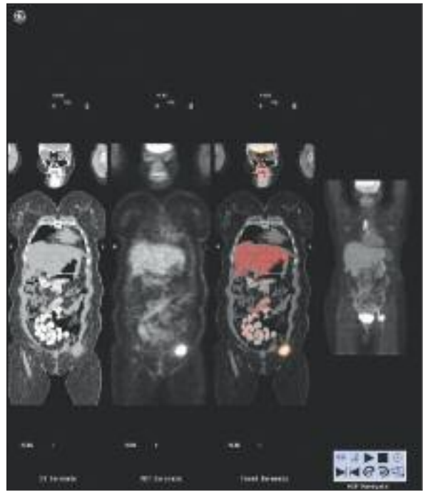
FIGURE 2: PET CT images showing increased 18F-FDG activity in the left inguinal region.