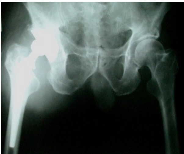
Figure 1. Radiographs of the hip joint showed no loosening of the hip prosthesis.

On physical examination the patient was afebrile with right hip tenderness, pain on motion, and a flexion contracture of 20 degrees. In his right groin there was a palpable mass approximately 15 cm in diameter. The patient had a positive iliopsoas sign. Laboratory findings were as follows: Hemoglobin 9.1 g/dL; white blood cell count 11.000/\text{mm}^3 with a predominant left shift; erythrocyte sedimentation rate 83 mm/h, C-reactive protein 115 mg/dL. Urinalysis was normal and urine cultures yielded no growth. A barium colon radiograph was obtained to rule out other possible sources of infection with no pathological findings. Parasitological assay of the feces and serological reactions for brucellosis, salmonella, HIV, HBV, and HBC were negative. Tuberculin reaction for tuberculosis was also negative. Plain abdominal radiographs revealed loss of the iliopsoas shadow and radiographs of the hip joint showed no loosening of the hip prosthesis or