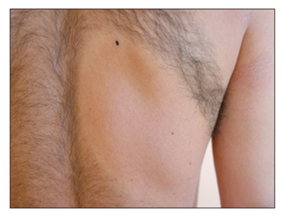
FIGURE 1: Erythematous slightly atrophic scale within alopesic site and erythematous atrophic macule on the right arm.

Folliculotropic MF has a broad clinical spectrum with acneiform lesions, comedones, plaques with follicular papules, alopecia, cysts and nodules, frequently on head and neck areas. Other important