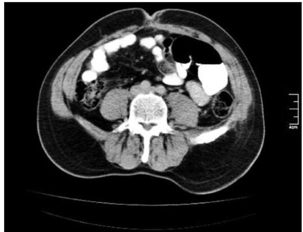
FIGURE 2: A computed tomography scene of the patient at six months after repair.

gle superiorly. A recent review suggests that TLH occurs more often in Petit's triangle than in Grynfeltt's triangle, with rates of 70% and 9%, respectively. 5