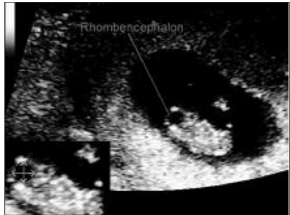
FIGURE 1: Sagittal section of the rhombencephalon with a diameter of 2.6 x 2.6 mm and its borders are seen on the close up image in the embryo with a crown-rump length of 17 mm (consistent with 8 weeks 1 days).

In the examination, the gestational week was determined based upon crown-rump length (CRL) 6 measurements in the first trimester. Fetal biometry parameters with the average biparietal diameter 7 , abdominal circumference, 8 and femur length 9 measurements were adopted from Hadlock et al. and humerus length 10 measurements were adopted from Jeanty et al. in the second trimester (18 th -24 th weeks of pregnancy). Rhombencephalic cavity was evaluated in the embryo between 7 th -10 th weeks of pregnancy. Rhombencephalon was measured from internal sides at sagittal plane. The anteroposterior length and cranio-caudal length were also measu-