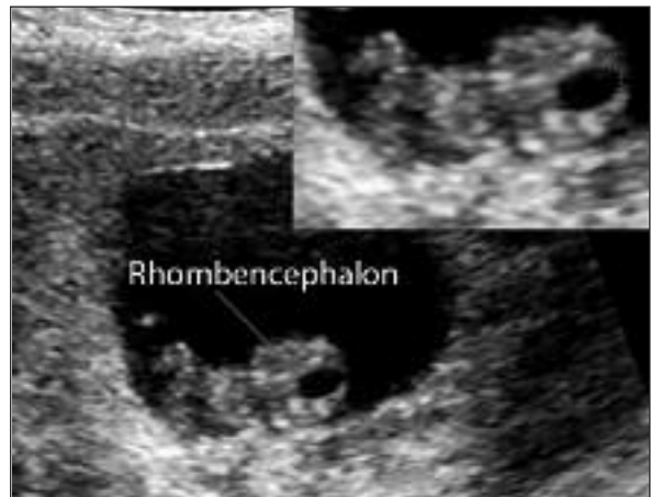
FIGURE 2: Sagittal section of the rhombencephalon with a diameter of 3.4 x 2.1 mm and its borders are seen on the close up image in the embryo with a crown-rump length of 17.7 mm (consistent with 8 weeks 2 days).