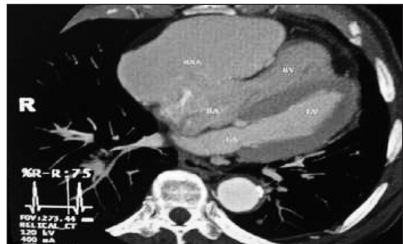
FIGURE 3: Computed tomography angiography scan demonstrating a right atrial aneurysm. LA; Left atrium, LV; Left ventricle, RA; Right atrium, RV; Right ventricle, RAA; Right atrial aneurysm.