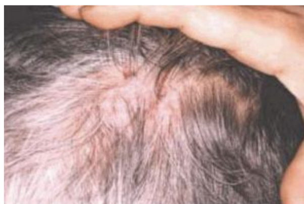
Figure 1c. The clinical appearance of the lesion after 20 weeks' treatment with only one resistant papule on the border of the lesion

The onset of clinical regression was observed at the 5 th week of therapy. The clinical regression at the 10 th week is presented in Figure 1b and the hemorrhagic crusts completely disappeared after 16 weeks of topical therapy. No side effect was reported except for slight erythema. As there was one resistant erythematous papule on the border of the lesion (Figure 1c), therapy was continued to 20 weeks having no additional response. Therefore, we suggested addition of cryotherapy to his current therapy but he acknowledged his satisfaction with the results of this therapy and refused. The patient demanded to continue the therapy for another 4 weeks. At the end of the 24 th week of the treatment no improvement was observed, so after the with-