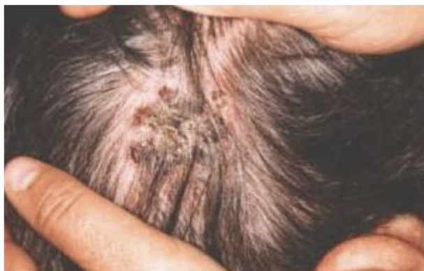
Figure 1a. Clinical appearance of the erythematous plaque before the treatment.