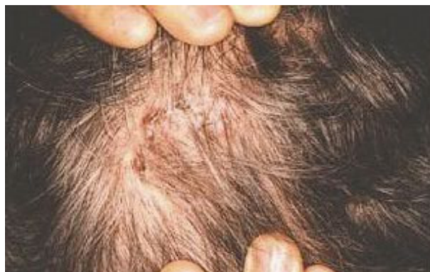
Figure 1b. Clinical appearance of the treatment, lesion after 10 weeks' imiquimod. Note the persistence of few

The diagnosis was previously confirmed with histopathological examination (Figure 2a) and due to the size of the lesion he was offered surgical therapy by the plastic surgery clinic. The patient refused the surgical therapy due to the potentially large resulting defect after removal. Since the patient was against surgical procedures (confirmed with informed consent), we offered him to apply topical imiquimod 5% cream five days a week and visit the clinic every month. Upon his consent, baseline photographs were taken and the size of the lesion was recorded. The patient was evaluated by two dermatologists at 3 rd , 5 th , 10 th , 16 th , 22 nd and 24 th weeks of therapy and monthly after the completion of the topical imiquimod therapy.